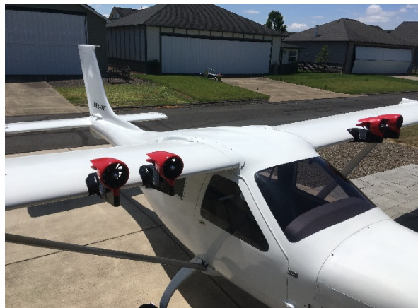
Figure 1: The JabirWatt

IDEAL (Integrated Distributed Electric-Augmented Lift) makes use of multiple Electric Ducted Fans (EDFs) mounted on a lifting surface, so they not only propel the aircraft but the high-velocity air over the top surface of the wing alters its aerodynamic properties. This self-funded, four-year project has made extensive use of wind tunnel testing with confirming in-flight testing using the JabirWatt aircraft. In-flight Jabirwatt testing began in September 2019. This short paper gives a brief overview of the project and the promising results to date.